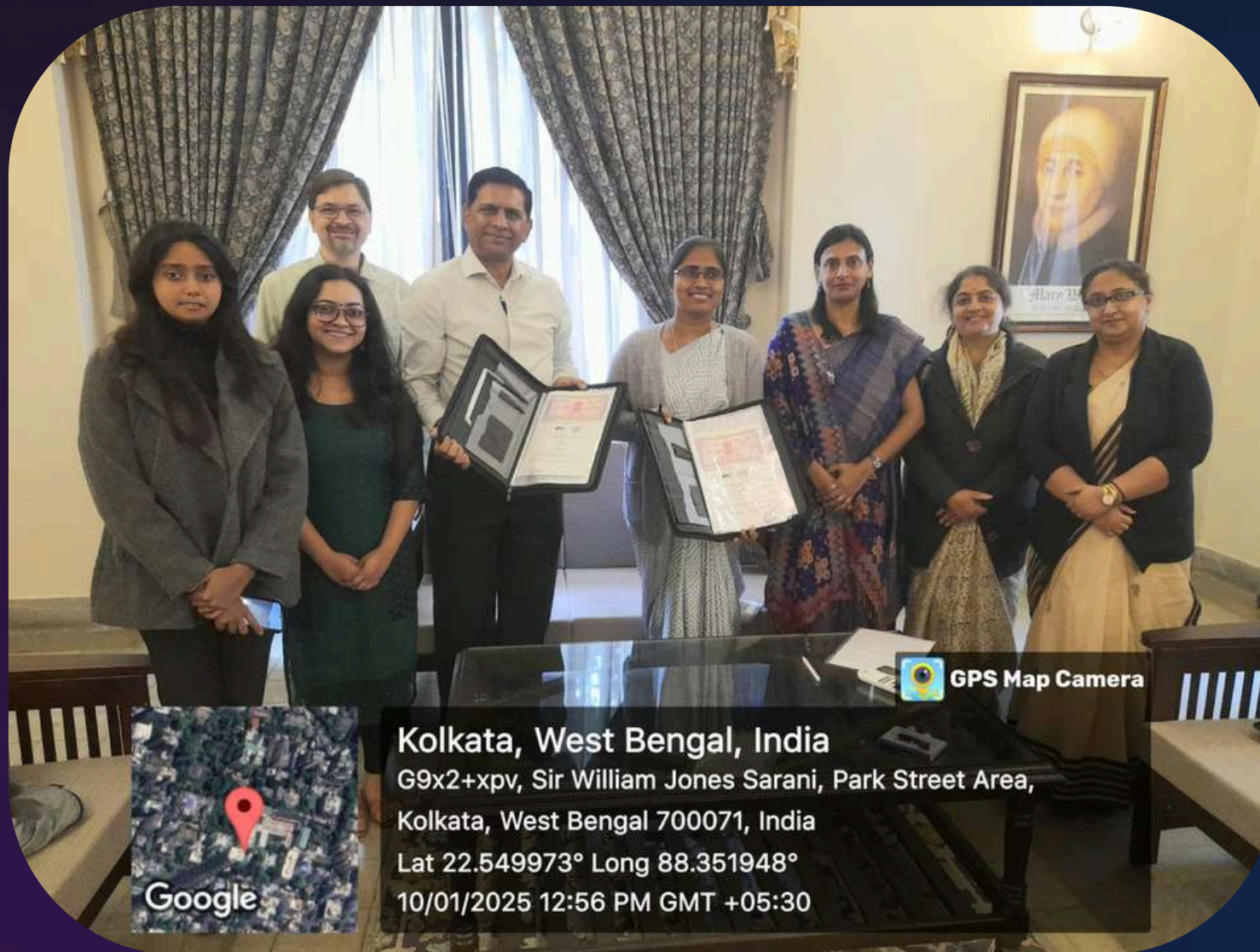
INDIAN AUTISM CENTER, KOLKATA JANUARY 10, 2025