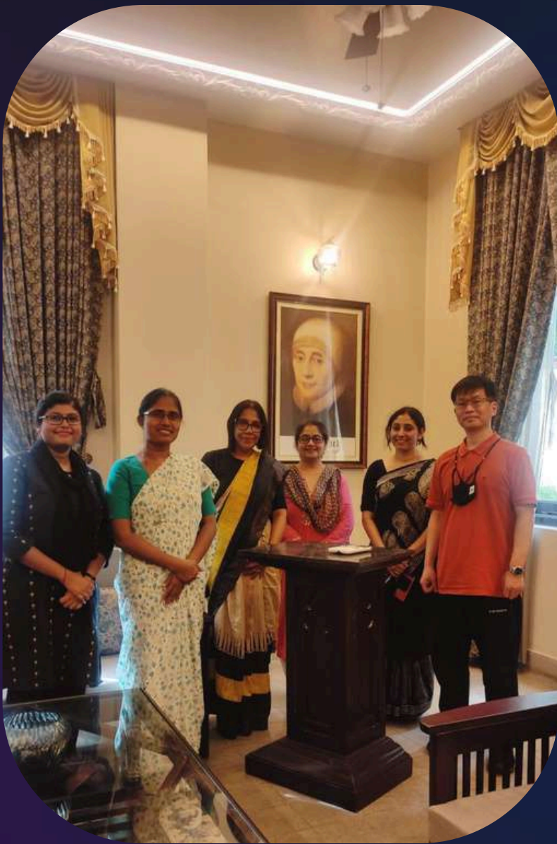
KOREAN CULTURE AND LANGUAGE CENTER, KOLKATA NOVEMBER 19, 2024