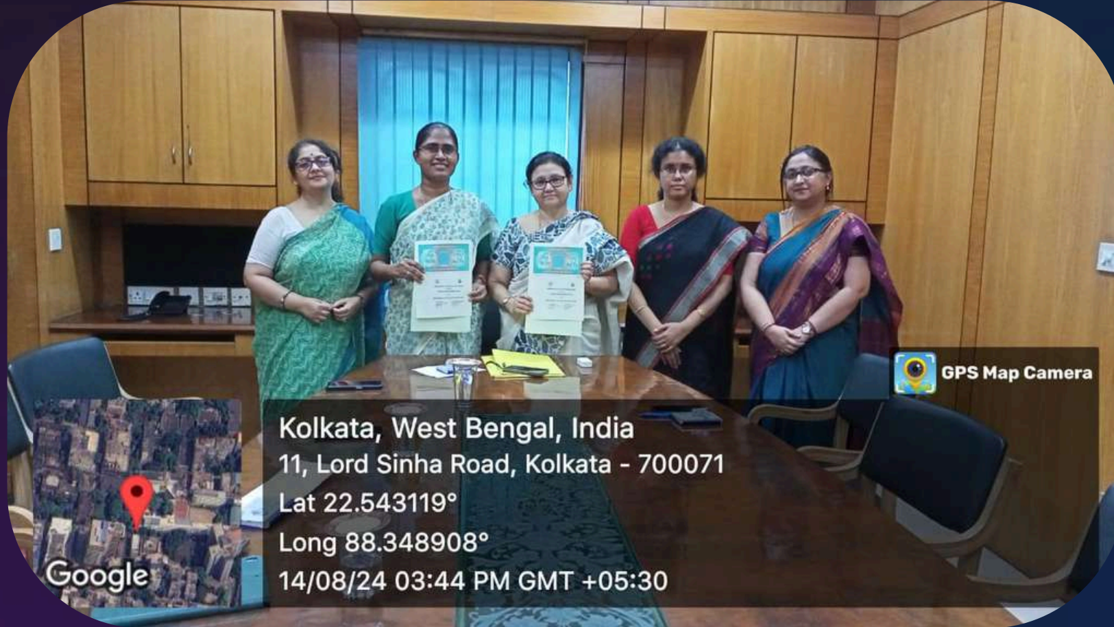
SHRI SHIKSHAYATAN COLLEGE, KOLKATA AUGUST 14, 2024