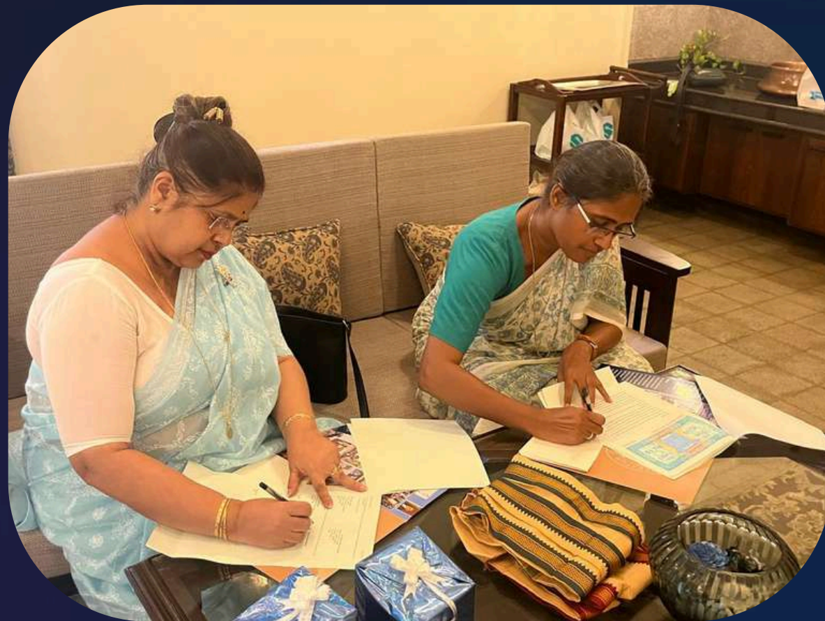
SCOTTISH CHURCH COLLEGE, KOLKATA JUNE 18, 2024