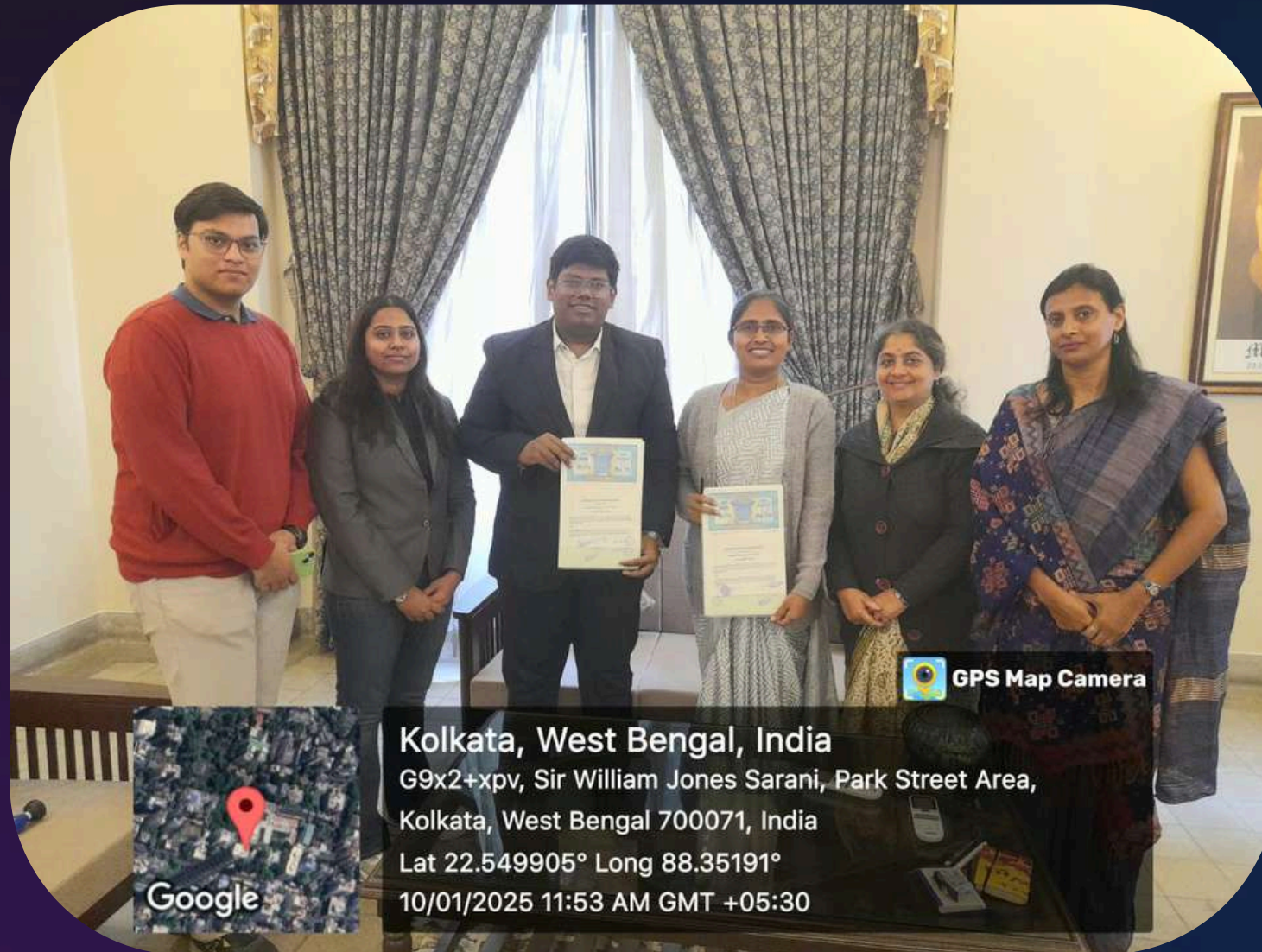
SANGHARSH EMPOWERMENT FOUNDATION, KOLKATA JANUARY 10, 2025