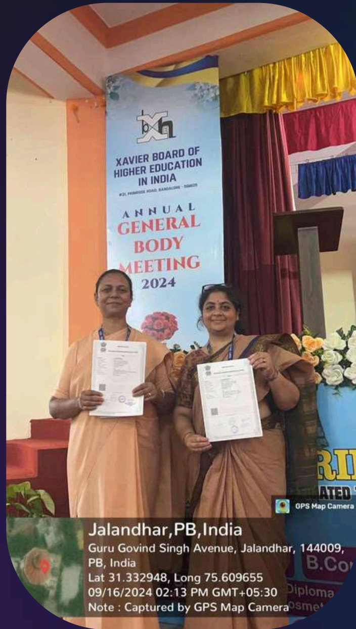
SOPHIA GIRLS' COLLEGE (AUTONOMOUS), AJMER SEPTEMBER 16, 2024