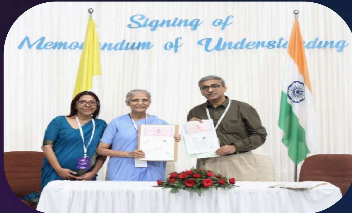
ST. XAVIER'S COLLEGE (AUTONOMOUS), MUMBAI MAY 14, 2022