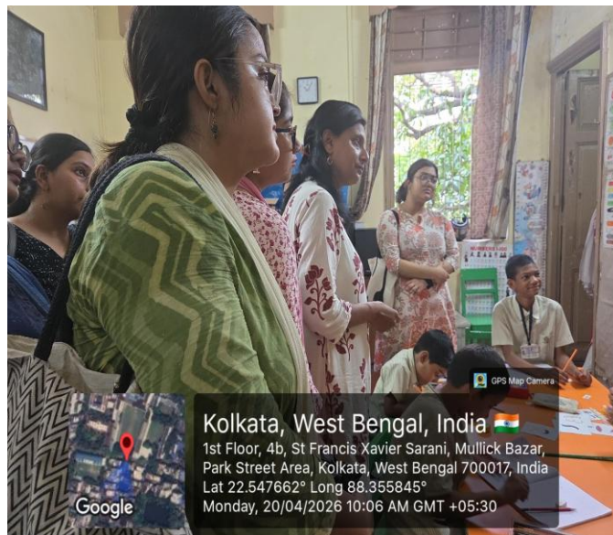
Kolkata, West Bengal, India 🇮🇳 1st Floor, 4b, St Francis Xavier Sarani, Mullick Bazar, Park Street Area, Kolkata, West Bengal 700017, India Lat 22.547662° Long 88.355845° Monday, 20/04/2026 10:06 AM GMT +05:30