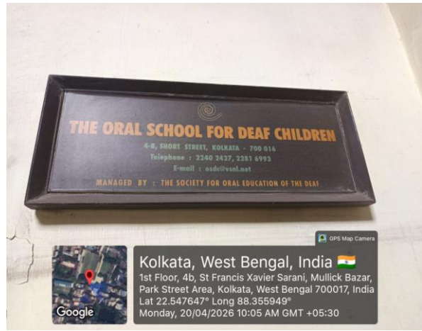
Kolkata, West Bengal, India 🇮🇳 1st Floor, 4b, St Francis Xavier Sarani, Mullick Bazar, Park Street Area, Kolkata, West Bengal 700017, India Lat 22.547647° Long 88.355949° Monday, 20/04/2026 10:05 AM GMT +05:30