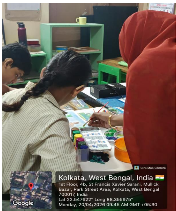
Kolkata, West Bengal, India 🇮🇳 1st Floor, 4b, St Francis Xavier Sarani, Mullick Bazar, Park Street Area, Kolkata, West Bengal 700017, India Lat 22.547622° Long 88.355975° Monday, 20/04/2026 09:45 AM GMT +05:30