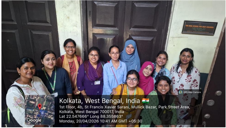
Kolkata, West Bengal, India 🇮🇳 1st Floor, 4b, St Francis Xavier Sarani, Mullick Bazar, Park Street Area, Kolkata, West Bengal 700017, India Lat 22.547666° Long 88.355863° Monday, 20/04/2026 10:41 AM GMT +05:30