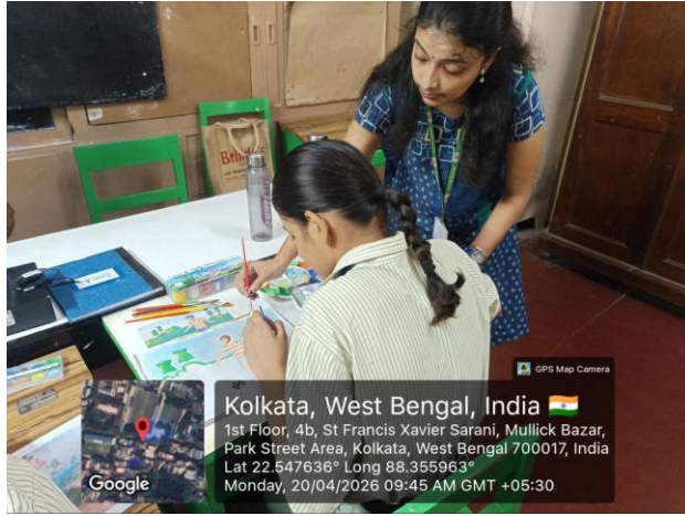
Kolkata, West Bengal, India 🇮🇳 1st Floor, 4b, St Francis Xavier Sarani, Mullick Bazar, Park Street Area, Kolkata, West Bengal 700017, India Lat 22.547636° Long 88.355963° Monday, 20/04/2026 09:45 AM GMT +05:30