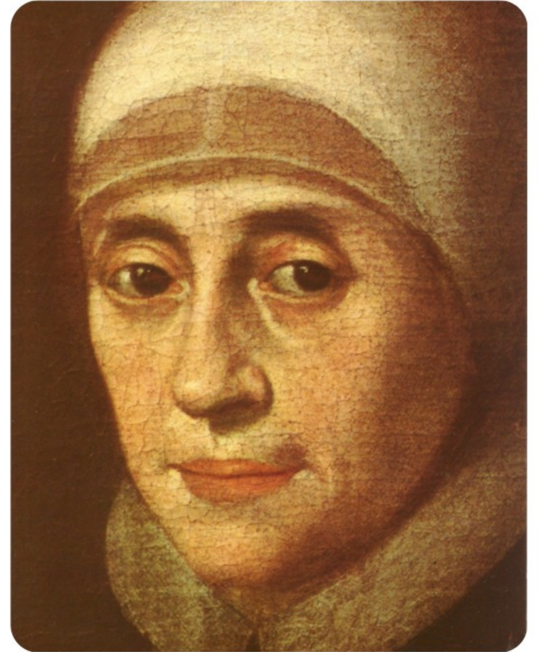
MARY WARD 1585-1645 Founder, Congregation of Jesus

Loreto College was established in 1912 and is managed by the religious order of The Congregation of Jesus . It is a Christian Minority college aided by the Government, committed to providing the highest quality education for women to enable them to develop their intellect and talents and to participate effectively and fully in society. This institution, which is now over a century old, has been awarded 'Heritage' status certified by the KMDA. Loreto College is an affiliated undergraduate college of the University of Calcutta. In 2016, the college received sanction from the University of Calcutta to begin a postgraduate Master's Course in English, and a Master's Course in Psychology has commenced from 2024. Loreto College's vision of holistic education and a commitment to high academic standards has culminated in it being awarded the status of CPE (College with Potential for Excellence) for the 3rd cycle in 2014. It has also been ranked by NIRF (National Institutional Ranking Framework), Ministry of Education, Government of India.