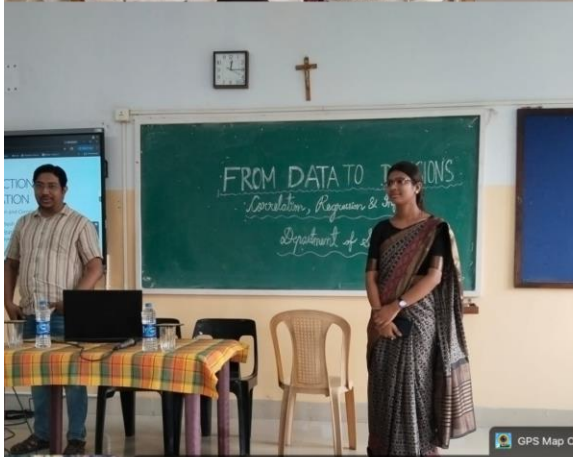
Kolkata, West Bengal, India 🇮🇳 Loreto House, Loreto College, 7, Sir William Jones Sara Park Street Area, Kolkata, West Bengal 700071, India Lat 22.54975° Long 88.351959° Friday, 17/04/2026 12:14 PM GMT +05:30