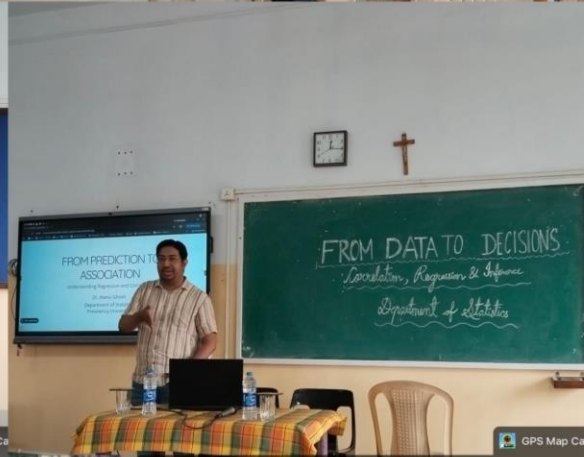
Kolkata, West Bengal, India 🇮🇳 Loreto House, Loreto College, 7, Sir William Jones Sara Park Street Area, Kolkata, West Bengal 700071, India Lat 22.549767° Long 88.351882° Friday, 17/04/2026 12:14 PM GMT +05:30